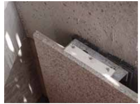
A granite slab is held in place on the exterior of the Arshat Center using a two-part clip assembly.

Under extreme loading situations such as hurricanes, tornadoes, earthquakes, or explosions, the ductility of fasteners becomes a significant issue. These loads are applied impulsively, like a hammer-blow, which can produce a different type of response from gradual or continuous loading in a structural element.