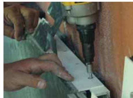
Self-drilling, self-tapping screws install quickly using hand-tools.

Case-hardening has been the most common method used. Low-carbon steel fasteners are heated in a high-carbon environment, infusing carbon into the outer layer of the steel and creating a hardened shell, or case , that is hard enough to drill and tap soft steel. The inner core of the fastener remains softer and more ductile.