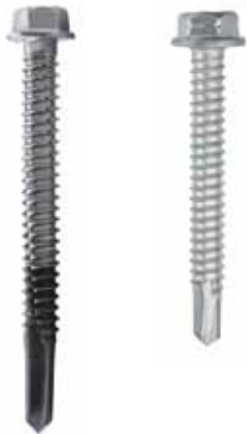
Bi-metallic fasteners are also selectively-hardened. The drill-tip and tapping threads are high-carbon steel, fused to a stainless steel shank (left, before coating). The high-carbon steel is hardened, leaving the shank unaffected. The entire fastener is then covered with corrosion-protective/galvanic barrier coating (right).

Since the Arshat Center was built, the science of selectively-hardened fasteners has continued to advance. First, bi-metallic